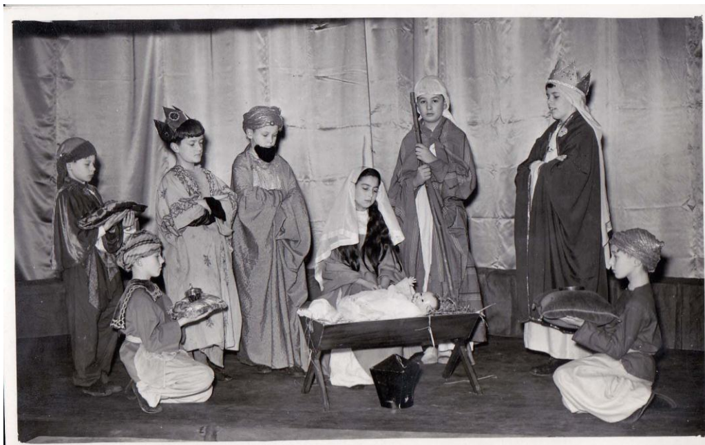
MCP Ref No 100032 1954 Nativity Play

I think I can add a little to your store from my own collection. I will try scanning them and sending them to you by e-mail. I expect your system can cope, living where I do my broadband connection is barely faster than pigeon post!