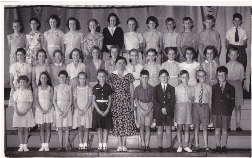
MCP Ref No 102469

Presumably a Class picture from 1955 or possibly 1954.