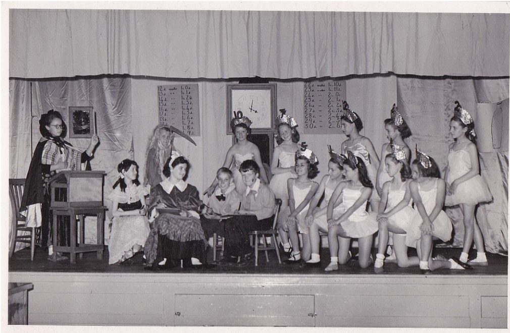
MCP Ref 102310 1955 Open Day – Plays – The Frolicsome Hours